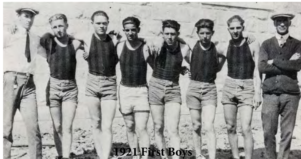
1921 First Boys