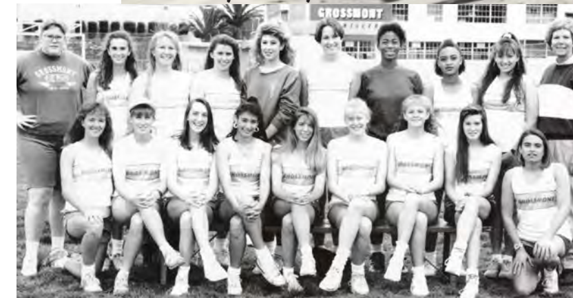
1992 Girls Track Team