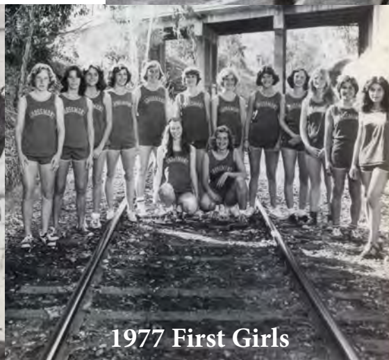
1977 First Girls